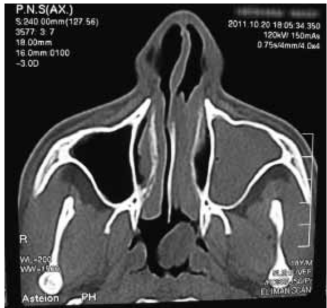
Fig. 2. Axial CT image of an antrochoanal with extension of the polyp to the nasopharynx.